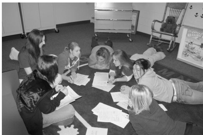
NCMCF YAC members work together to determine funding amounts during a mock grant review session at their YAC orientation meeting.