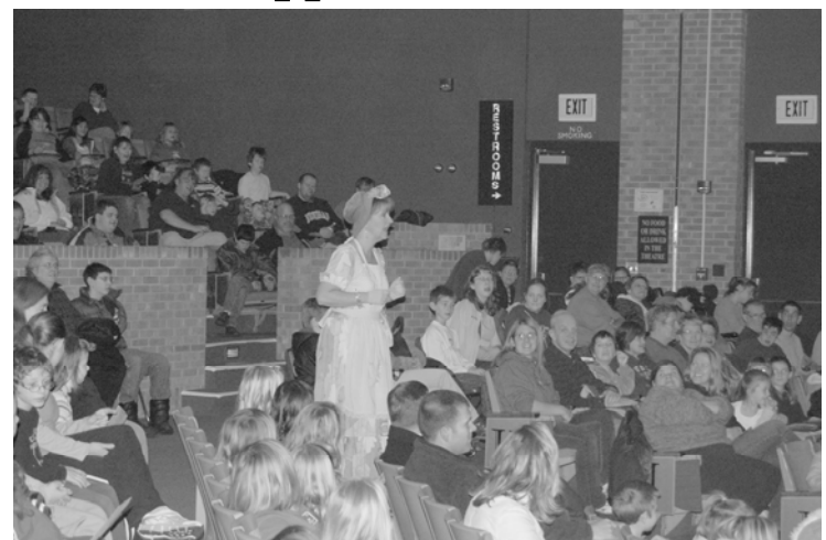
A 2008 grant to Kirtland Community College helped put on the Kirtland Youth Theater during the summer for children and their families.